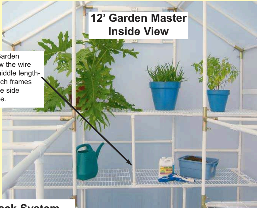
12' Garden Master Inside View

Inside view of 12' Garden Master showing how the wire racks meet in the middle lengthwise. The back bench frames are 42" wide and the side shelves are 49" wide.