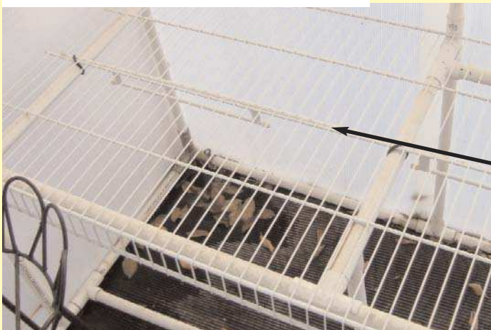
New Wire Rack System

New wire racks we are now using. Note how they meet in the middle widthwise. The new shelves do not require the over-size shipping charge so they are less expensive to ship.