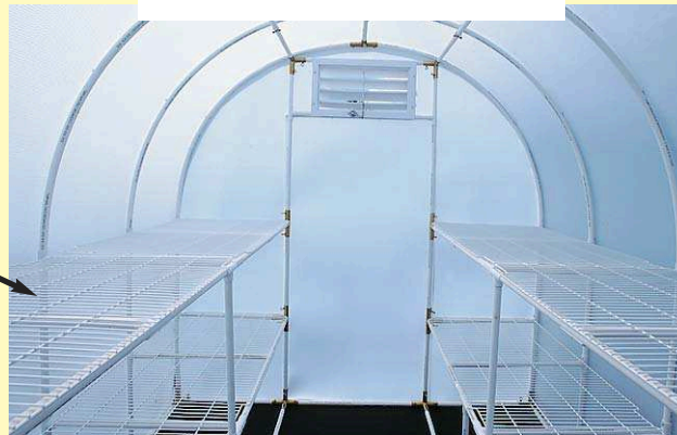
8' Oasis - Inside View

Each 4' wire rack covers one-half of the 8' bench frame. Benches join in the middle to form one long shelf.